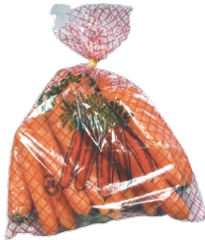
■ Carrots in small plastic package