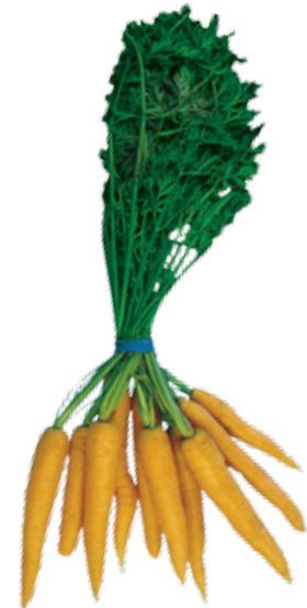
■ Bunched carrots