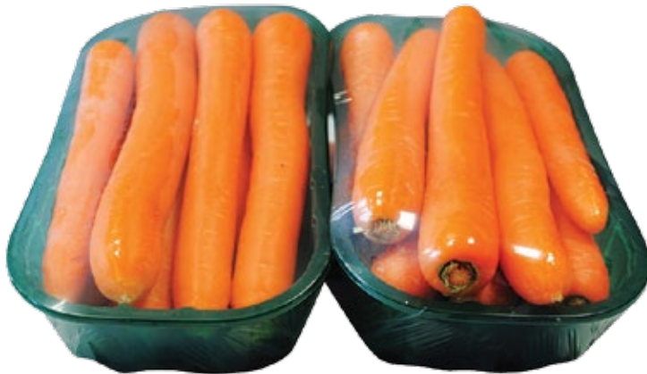
■ Carrots in foam tray covered with plastic - PROPER PACKAGING FOR EXTRA CLASS *