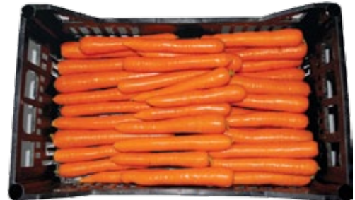
■ Carrot in plastic box - PROPER PACKAGING FOR CLASS I *

* within the same package of Extra Class and Class I carrots the size and shape of carrot should be uniform