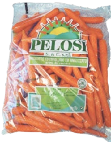
■ Carrots in plastic bag - PROPER PACKAGING FOR CLASS I

* within the same package of Extra Class and Class I carrots the size and shape of carrot should be uniform